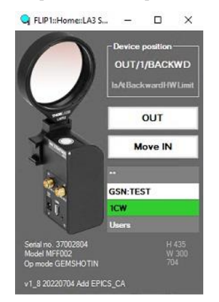
Figure 3. Flipper control interface configured to move IN on-shot.

To address the issue, a simple flipper control application was introduced which could be configured to automatically move a flipper into (or out of) the beam on-shot. The associated control systems were also modified so that the users could move the flipper in or out as required on lower-power energy modes.