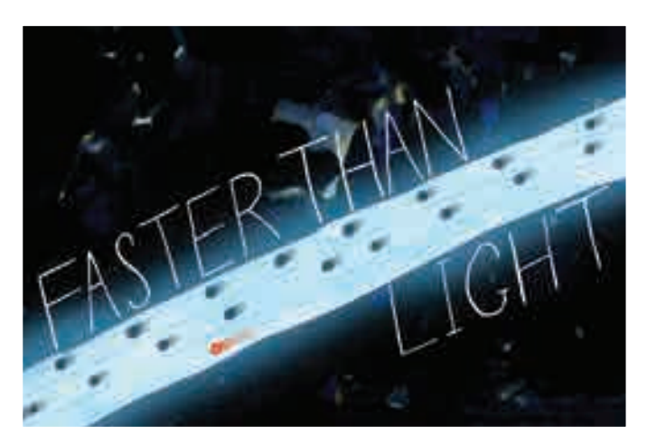
A series of illustrations depicting high power laser scientific highlights for the special CLF edition of in.brief