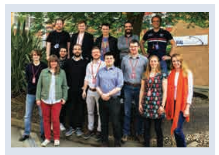
Training Weeks in 2017 continued to provide an excellent opportunity for participants to network with other members of the EU high power laser community, as well as benefit from hands-on and classroom learning provided by the CLF.

The communications team also produced a special issue of in.brief (the STFC weekly internal newsletter) in March 2018, carrying 15 stories about CLF work and staff. An internal email newsletter specifically for CLF staff was successfully piloted in early 2018, and will now be issued every two months, featuring a mixture of CLF highlights, staff news and events.