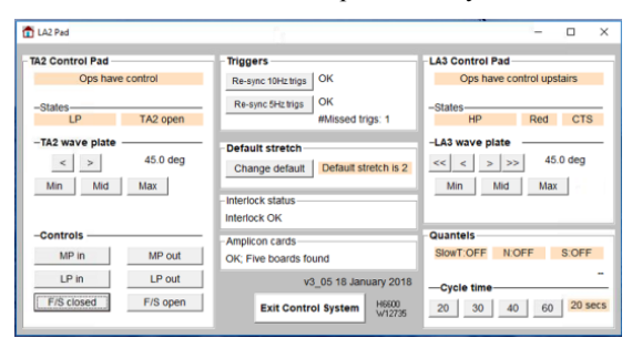
Figure 2: Operator's Home window

3 and 4). The latter has proved particularly useful on several occasions to enable us to debug fast shutter behaviour, and to demonstrate to users how that part of the system works.