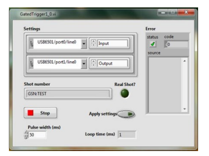
Figure 5: Trigger relay application

A recurring issue within Gemini is the difficulty of integrating new instruments into our particular shot number system. The spectrometer was a case in point. The Avantes software provides an option to save data to a known file when an electrical trigger is received by the spectrometer. We implemented a LabView application to propagate to the instrument the triggers associated with actual shots and to rename the raw data files accordingly (Figure 5). A .NET application then polled for these files, performed a simple plot of the data, and massaged the files into the form required for submission to the data archival system (Figure 6).