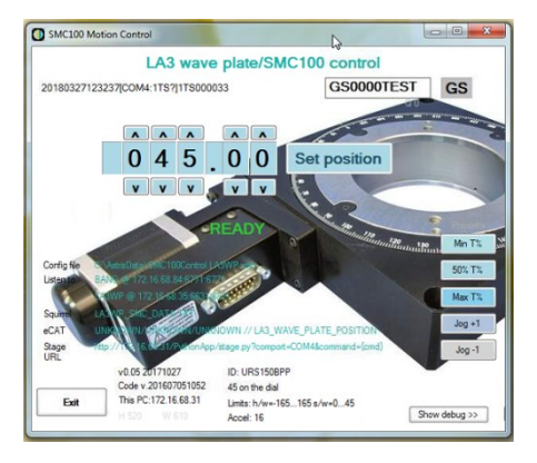
Figure 1: LA3 wave plate motion stage application

The software architecture within Gemini is slowly evolving to become more distributed, so a Python cgi-bin was written to, in effect, network-enable both stages. This had the advantage of allowing multi-access to the devices in the form of a dedicated control application (Figure 1), as well as continuing integration with the main Control System and those in the two Target Areas.