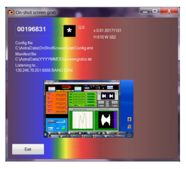
Figure 7: Dazzler screen grab application

A simple .NET application was written to perform on-shot screen grabs and save the resulting images. Although the screen-grabs are not diagnostic data per se , the application has proved a useful tool as it enables the Operators to keep track of Dazzler parameter changes (Figure 7). A number of other applications are planned.