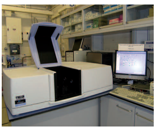
Figure 1. The Lambda 950.

This instrument will enable accurate absorption measurements in the near-infrared, 1300 - 1900 nm, of aqueous samples essential for proposed developments of temperature-jump time-resolved infrared spectroscopy.