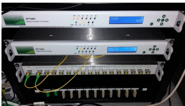
Figure 1 Installation of the Greenfield Master Oscillator and Slave Unit in the Front-End Oscillator Room.

The parallel operation of the two timing systems freely allowed direct comparisons between them to be made with minimal disruption of normal Facility Operations.