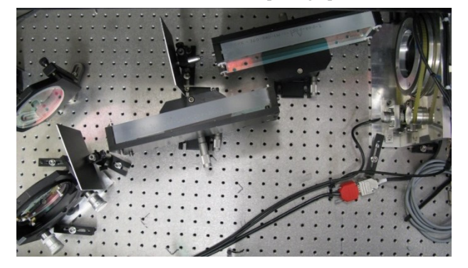
Figure 2. Layout of the new polarisers for TA2. The beam enters through the waveplate at upper right and is steered via the polarisers to the folding mirrors at left, where it is injected into the original beam path.

slightly, and the waveplate was moved to a position ahead of the polarisers. The polariser plates are wedged, and when the beam is being strongly attenuated, some of the light reflected from the rear surfaces emerges, and must be blocked by the metal screens that can be seen in the photograph.