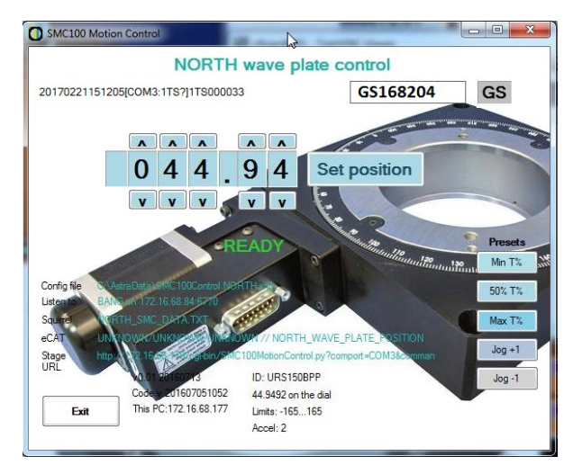
Figure 4. Screenshot of the waveplate control app, showing the controls for setting the stage position, and the buttons for the preset positions.

The motion stages have been network-enabled by use of a cgibin Python script, and each can be controlled via a custom application run at the point of use. Figure 4 is a screenshot of one of the applications. Users and Operators can set a specific orientation for the stage, or "jog" it to pre-set positions corresponding to percentage transmissions of the wave plate. The application is also integrated with the Gemini shot number broadcast system so that wave plate orientations can be recorded on-shot. The software records the stage positions, i.e. waveplate orientation rather than transmission; typically in each experiment the waveplates are calibrated to give a conversion table between orientation and energy.