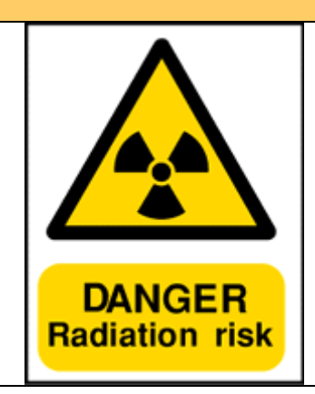
Edition 17.1 – May 2022