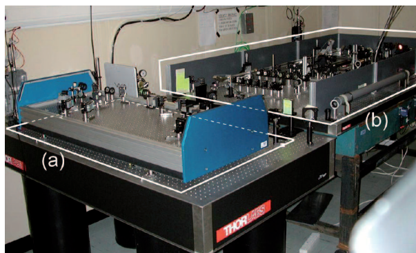
Figure 1. Annotated image of the 10fs 1kHz compressors installed in Astra TA1. (a) Prism compressor (input 1mJ, 2ps, output < 30fs, 0.8mJ). (b) Hollow fibre compressor (input < 30fs, 0.7mJ, output < 10fs, 0.4mJ).

Following transmission into the target area, the amplified pulses are compressed by two pairs of Brewster-angled fused silica prisms: by changing the prism pair separation, the dispersion of the compressor can be accurately