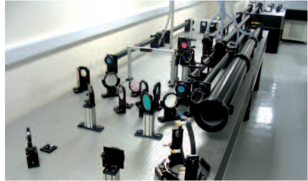
Figure 9. Photograph of the north amplifier table.

Once the design had been fixed, the optomechanical components were positioned on the tables according to the CAD model. This was done using templates which were produced by printing out 1:1 scale top view drawings and cutting out the footprints of the components. The templates were positioned on the tables using the tapped hole pattern for guidance. Fig 9 shows a photograph of the completed north amplifier table.