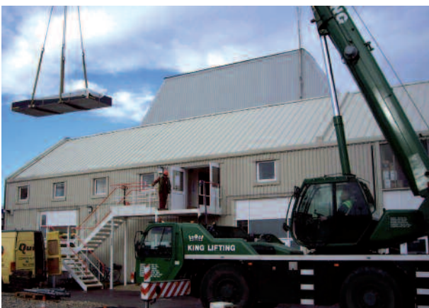
Figure 4. The second pump laser table on the last stage of its journey to the Astra Gemini laser area.

The pump lasers were built by Quantel SA in France, and were delivered to RAL in November 2006 after some delays due to resolving electrical noise problems. The laser tables and some of the electronic racks were lifted into the laser room by an expert contractor (Figure 4). An additional surface table was also moved into the area at this time to give some working space and to accommodate possible future laser systems: to move another table in after the pump laser installation would be extremely difficult. The original specification of the lasers required them to fire once a minute, but the upgraded version has the capability to fire a shot every 20 seconds. One consequence of this is that the second harmonic crystals and harmonic separation mirrors have to be on separate tables from the lasers themselves, increasing the footprint of the system. The four extra 45 mm rod amplifiers also require extra rack space for their capacitor banks. The cable lengths between the capacitor banks and the laser heads were specified as 6 metres, to allow the majority of the capacitors to be installed in the services area below the laser room, with the cables passing up via the floor penetrations. The racks for these capacitors are mounted on frameworks to ensure all the cables can reach the