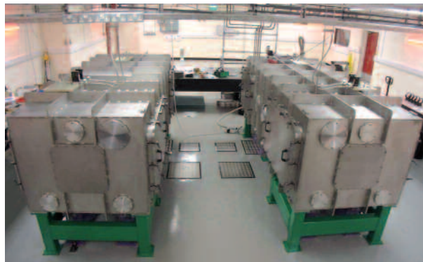
Figure 2. The compressor chambers in place in the laser area.

Lifting the six optical table sections, each 1.5 metres wide and nearly 4 metres long, and two compressor chambers, each weighing 2.2 tons, into the first-floor laboratory was done by an outside contractor (Figure 1). The doorway into the area was made wider than normal to accommodate the width of the chambers, but even so there was little room to spare.