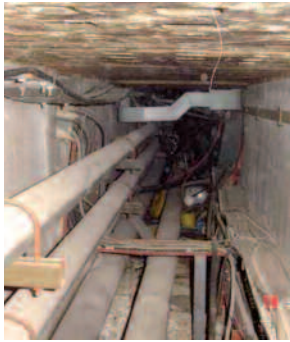
Figure 7(a) View of the trench used for beam transport, before clearing.