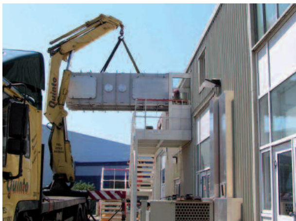
Figure 1. Lifting one of the compressor chambers into the Gemini laser area in R7.

Following the handover of the laser laboratory on the first floor of R7 in April 2006, an all-hands meeting was held in the area to inform CLF staff about progress in the project and the next stages. This was the last time that the space was available for such an event, because the installation of the main amplifier tables and the compressor vacuum chambers took place shortly afterwards. Before that, the laser and target areas were surveyed accurately and sets of reference points marked on their floors and walls so the tables and chambers could be positioned with the required accuracy.