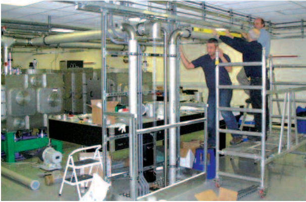
Figure 3. Installation of the main vacuum pipes.

based Cerberus system in use on Astra. As the interface between Astra and the Gemini laser area is a single beam line with one shutter, the interaction between the two systems is minimal, and does not cause any difficulties. It is intended to replace the Astra interlock system with the same new technology when convenient.