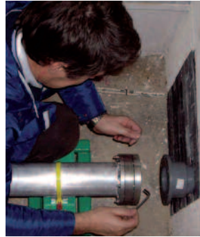
Figure 7(b) Installing the lens at the output of the relay pipe.