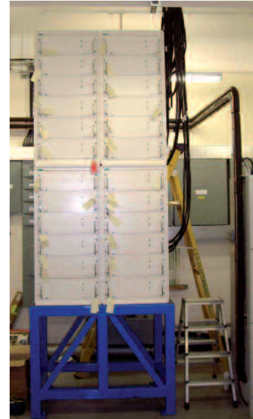
Figure 5. Capacitor racks for the north pump laser.

correct laser heads on the tables upstairs (Figure 5). In the final installation, all the capacitors for the 16 mm, 25 mm and 45 mm rods are in the services area, and the remaining capacitors, power supplies and cooling groups are in small racks that fit under the laser tables. Following the delivery of the components, the installation and commissioning of the lasers was carried out by engineers from Quantel over a two-week period in December.