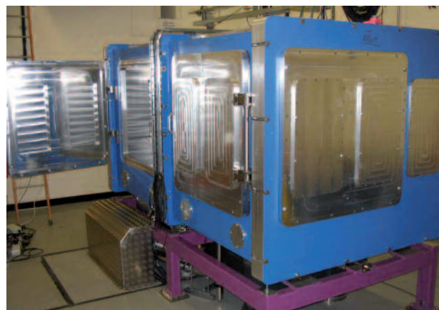
Figure 6. The interaction chamber in position in Target Area 3.

The main piece of hardware to be delivered to the target area was the interaction chamber. This was constructed in two sections, of a size limited by the entrance to the area, and is made of aluminium to minimise the effects of activation. The design incorporates internal breadboards for mounting the optics and other components, and as in the compressors these are supported independently from the vacuum vessel. The chamber support frame bridges the trench in the floor that is used to bring the vacuum pipes from the services area next door. Figure 6 shows the chamber and its support frame after installation of the vacuum components in the trench below. As well as the chamber, large amounts of lead and polythene radiation shielding were installed to block the two wall apertures on the North and South sides of the room. These were built to allow future development of the facility, especially the use of the adjacent room on the north side for long time-of-flight diagnostics. Until such diagnostics are brought online the shielding will ensure the safety of personnel working in those areas.